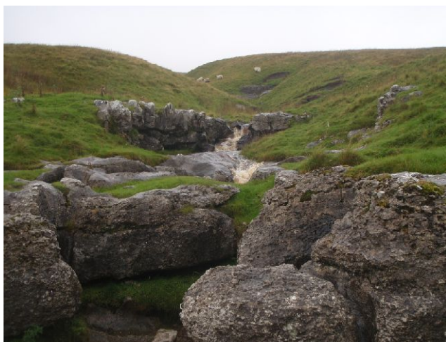
The surface stream and sink