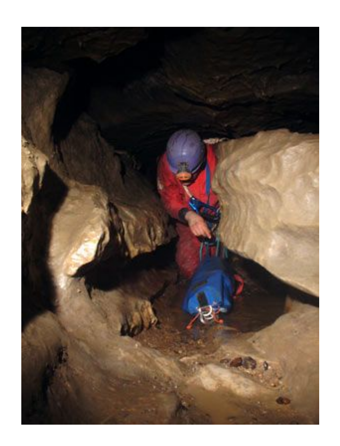
A <u>Black Rose Caving Club</u> trip report.