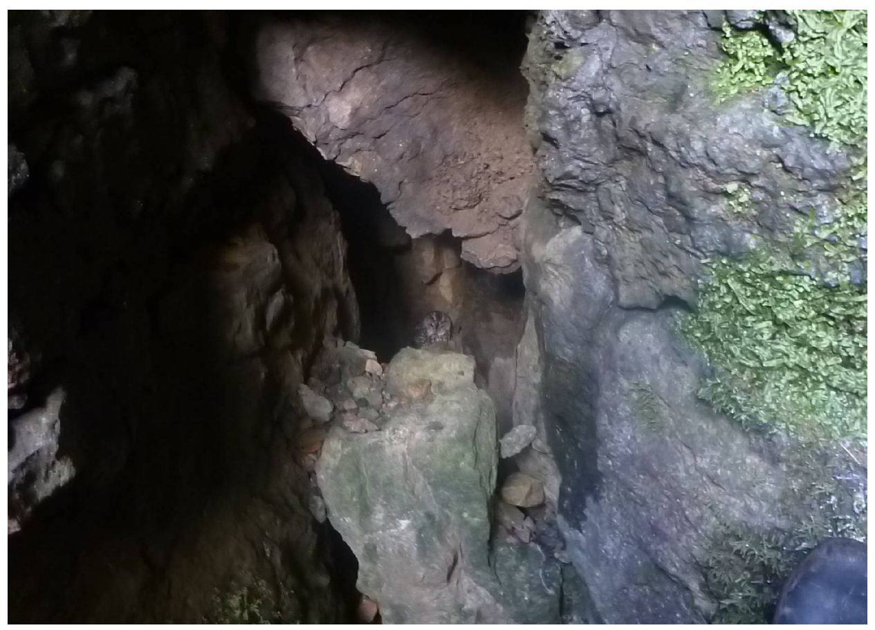
I stopped in at hooters on the way down the pitch. (Look in the centre)

At the bottom a rather disgusting hole awaited me, full of mud and animal bones, It felt as if I was descending through a graveyard. Thankfully this descent was short and I was soon at the second pitch after a short bit of larger passage. I spent a little bit of time looking at the free climb and decided to give it a try on the way back out. The next pitch was almost immediate I could have got away with using a 20m rope for both. This pitch was a little snug at the top but easy enough. Round the corner was the 4<sup>th</sup> pitch where I could only find one bolt and it looked tight. I solved the one bolt problem by using the 3<sup>rd</sup> pitch rope as a backup. I then had to tackle the smallness. It's bark was far worse than it's bite, I slithered through easily after giving my self enough slack on my stop.