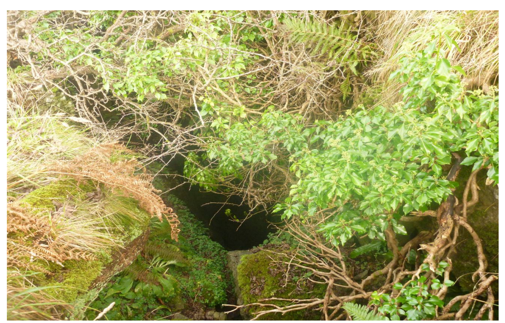
Overgrown entrance, handy tree to my left (out of shot) to rig a traverse line.

I advertised a trip to Wharfdale and as expected I got zero interest. To be fair though, it was a Sunday. No one it seems to want to go caving on that day, perhaps everyone I know is deeply religious? Anyway I did not let a thing like zero interest stop me! I decided to hit Yockenthwaite, mainly for the fact it was covered by NFTFH, so I had an excellent description to guide me.