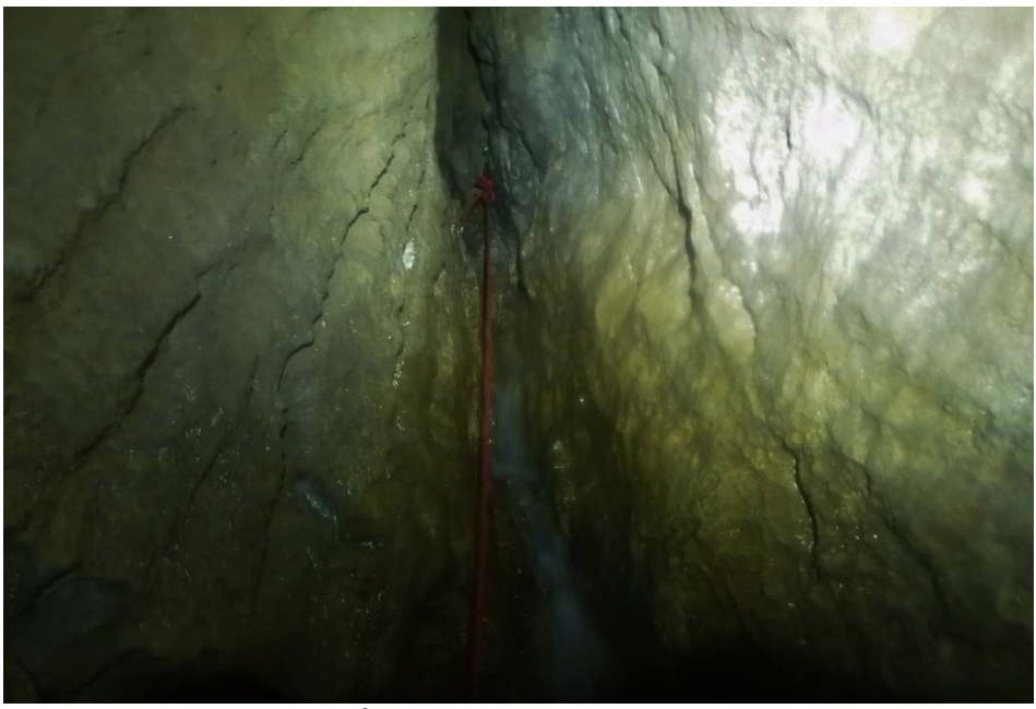
Looking up the rather snug 4<sup>th</sup> pitch from the ledge.

I landed easily on the ledge a few meters down. Looking up it would have been possible though foolhardy to free climb to this point. Safe on a wide ledge, I decided to get off the rope and look for the Dry pitch bypass. It was here things started to go wrong. First I got stuck in the bedding squeeze bypass as gear got caught. I freed my self but I had to do it twice for other gear I left behind. Would have loved having a partner for this bit.