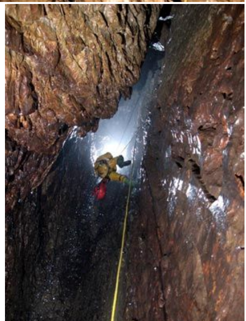
A Black Rose Caving Club trip report.